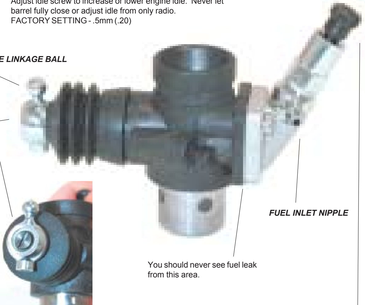
FUEL INLET NIPPLE

You should never see fuel leak from this area.